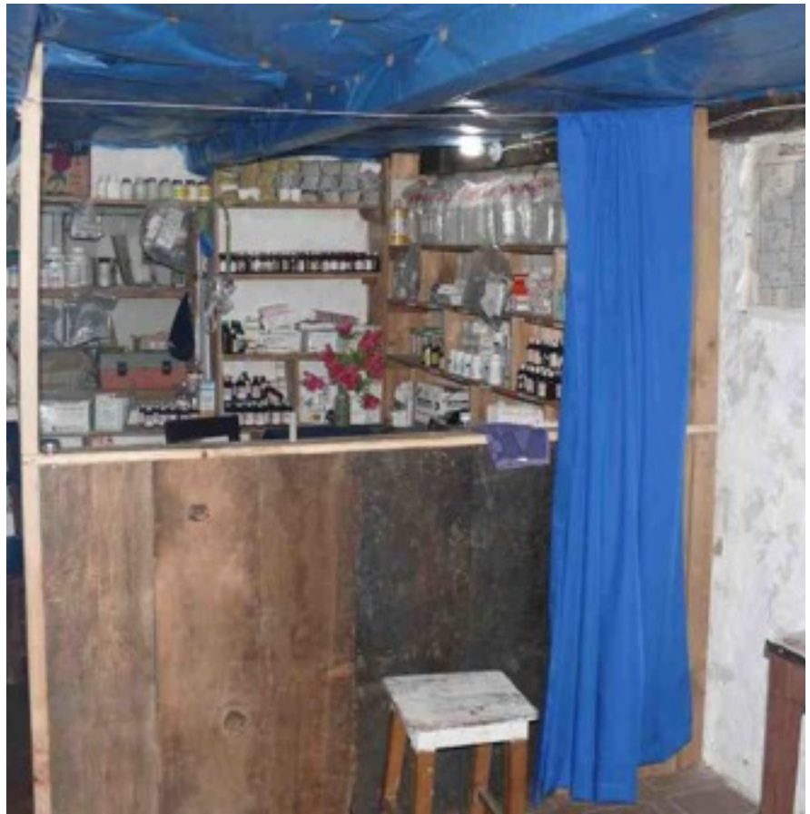
Out patient room at KFK clinic, Goljung. >>>>>